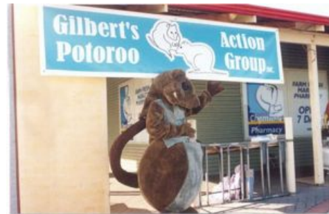
“Gilbey” GPAG’s Mascot

To join Gilbert's Potoroo Action Group or to make a donation please fill out the attached forms.